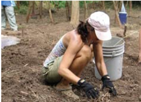
'Onipa'a O Na Hui Kalo