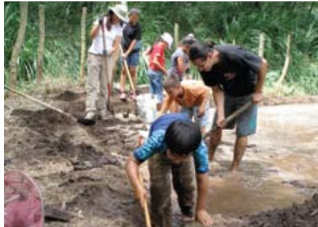
'Onipa'a O Na Hui Kalo