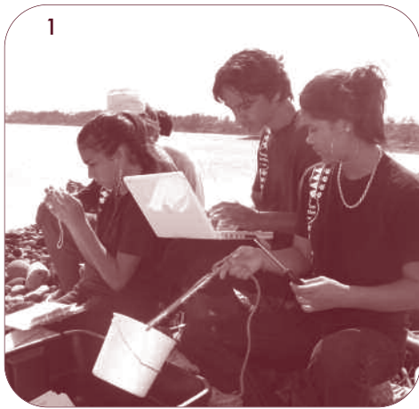
1 The Waihe'e shoreline was a source of rich data for this Kalama Intermediate science team using laptops, temperature probes, GPS units & digital cameras to record their findings.