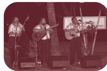
The legendary Mākaaha Sons have been sharing their special sound of Hawaiian music for over 30 years. How fortunate we were to have them close a stellar evening of aloha.